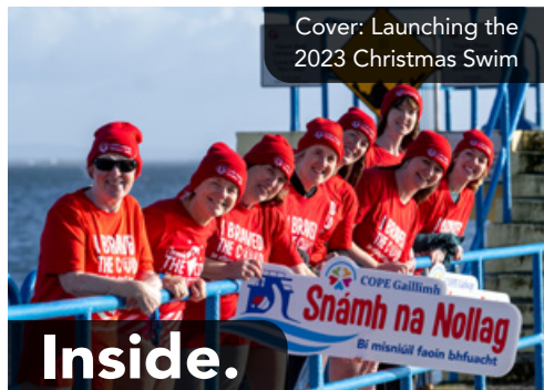
Cover: Launching the 2023 Christmas Swim