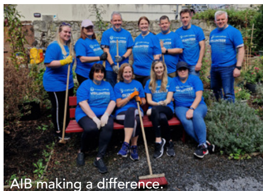
AIB making a difference.

A team of 12 from AIB travelled from Donegal, Dublin and Mayo to take part in another of our projects, led by a member of our Senior Support team, who provides community support to older residents. The project involved a garden clean up and the group very kindly supplied a bench for the garden they were working in. This great addition will allow the residents of the area to relax and enjoy the space.